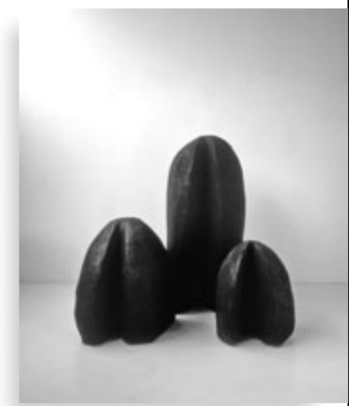
'Humps' by David Nash for Korea