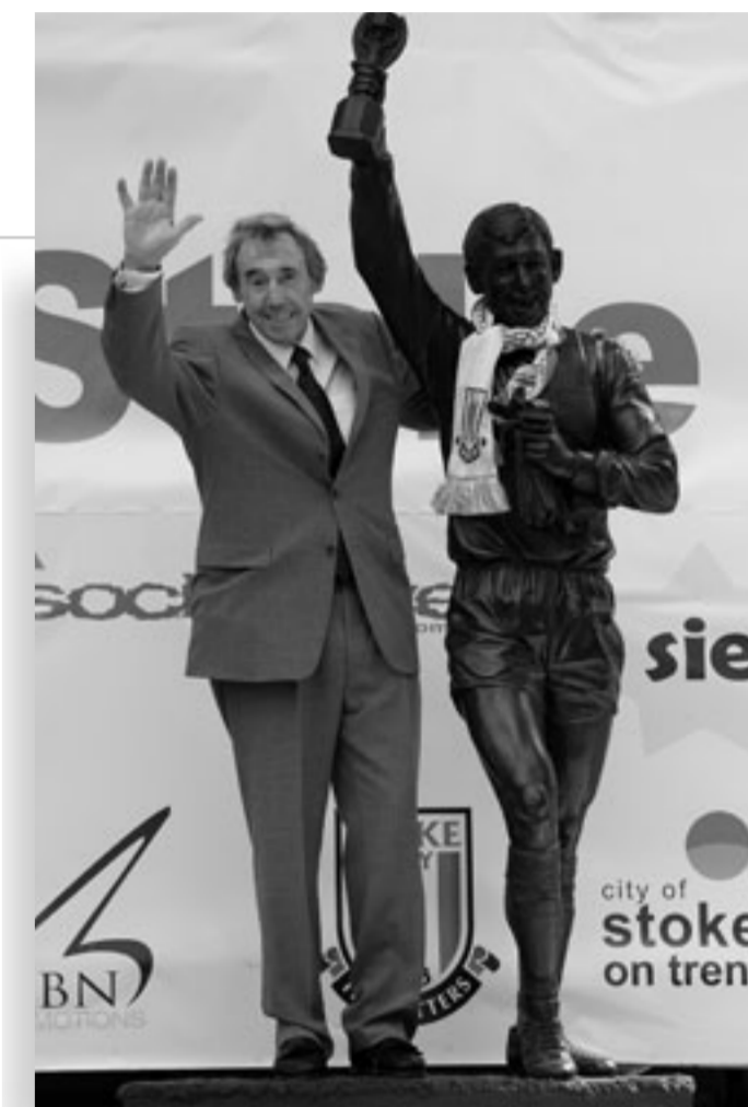
Gordon Banks unveils his statue